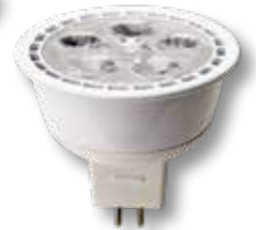
6.5W GU5.3 MR16