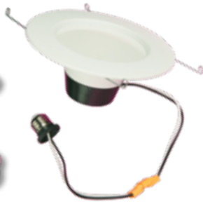
5" & 6" Downlights