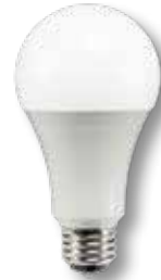
17/10/6 W A21 3 Way