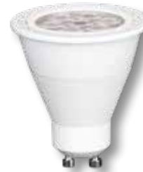
7W GU10 MR16