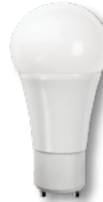
17.5W GU24 A21