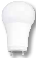
10W GU24 A19